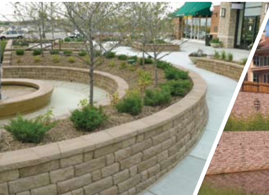
HIGHLAND STONE® 6-INCH RETAINING WALL