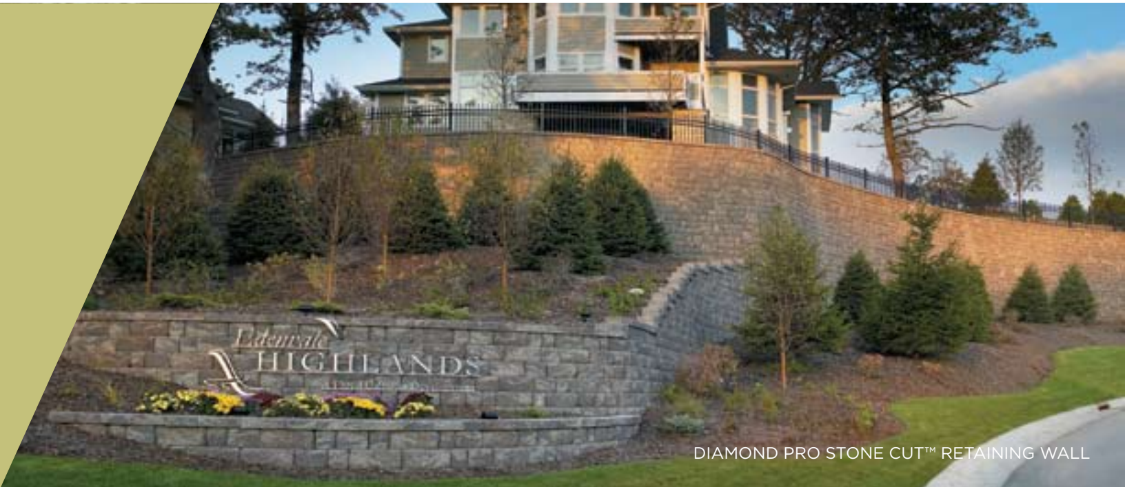
DIAMOND PRO STONE CUT™ RETAINING WALL