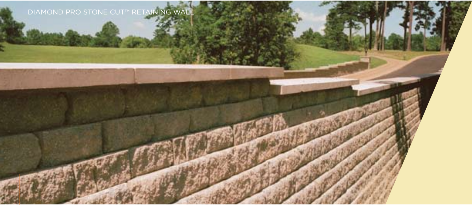
DIAMOND PRO STONE CUT™ RETAINING WALL